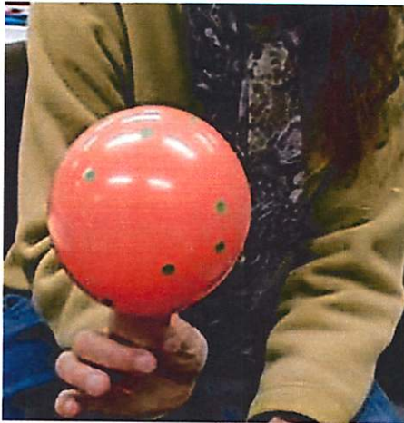
The small balloon universe. Each dot is a cluster of galaxies. Notice the triangle.

Each dot represents a cluster of galaxies, a hundred million light years across.